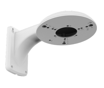
XLGNXLB14C Wall Mount Φ120mm × 105.8mm x 183.5mm